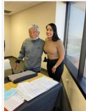
PGI Global recruiting unsuspecting vulnerable 86-year-old into the ponzi scheme